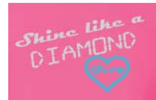
Design G Silver GLITTER and Columbia Blue design, approx. 10" wide, centered across chest, angled , SHIRTS ONLY