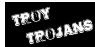
Design W White design approx. 10" wide, centered across chest, angled . Design X White design vertical in straight line, hip down in a straight line on pants or on left side of shirts or sweat jackets.