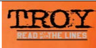
Design C -Black covered in glow in the dark ink making it look soft black. Hidden message between the lines is glow in the dark ink and only shows up good in the dark when it glows. Approx. width 11", straight across chest, SHIRTS ONLY